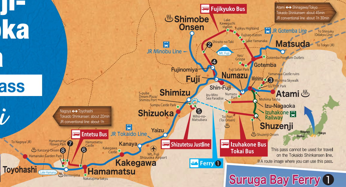
Hamamatsu Flower Park 7 (around April)