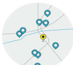
Rent and Return Anywhere!