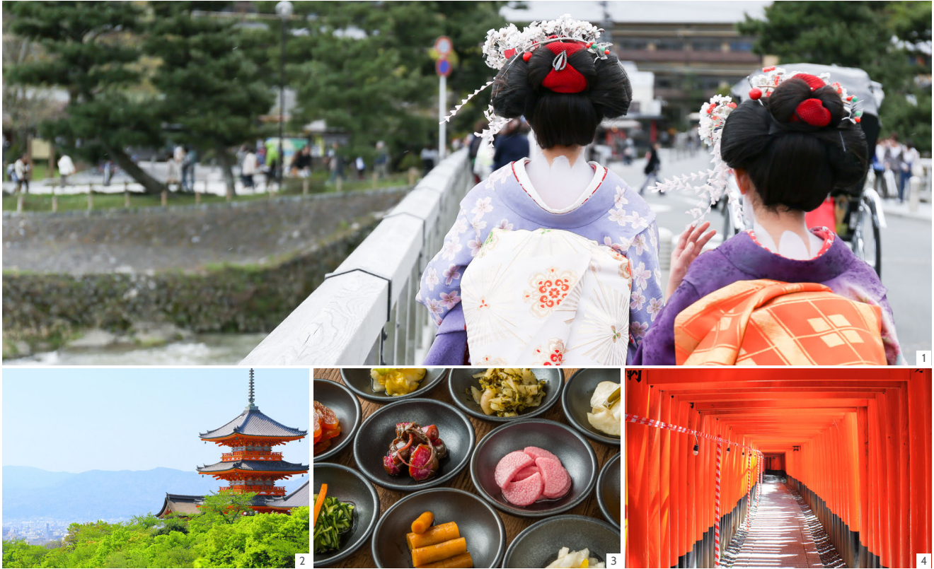
1. Apprentice geisha 2. Kiyomizu-dera 3. Kyoto style food 4. Fushimi-inari-taisha(Shrine)

The city of a thousand years history. The city of international tourism.